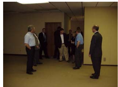
COMMISSION MEMBERS ON TOUR OF COLLINS OFFICE BUILDING